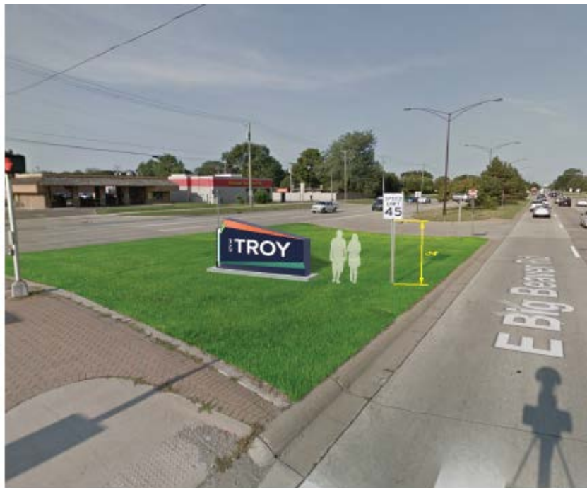
Big Beaver Rd. at Dequindre