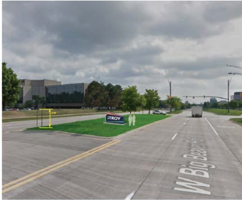
Big Beaver at GolfView